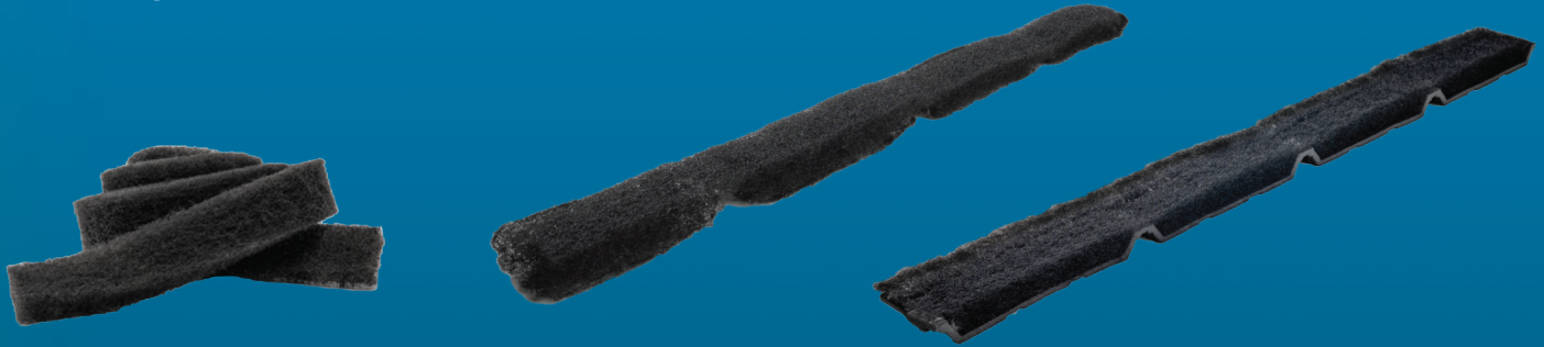
UltiVent™ Universal Fit